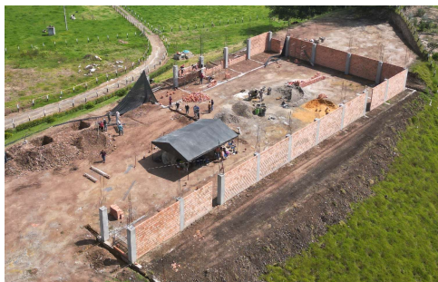
Father's House Gymnasium

For the last year or so, God has been speaking to us about how to go about eating an elephant, or in this case taking on the huge task of building a Christian School and large church, with nothing but a mortgaged piece of land and a lot of faith. The answer is, you just keep going, taking one bite at a time of the elephant, as funds and teams allow.